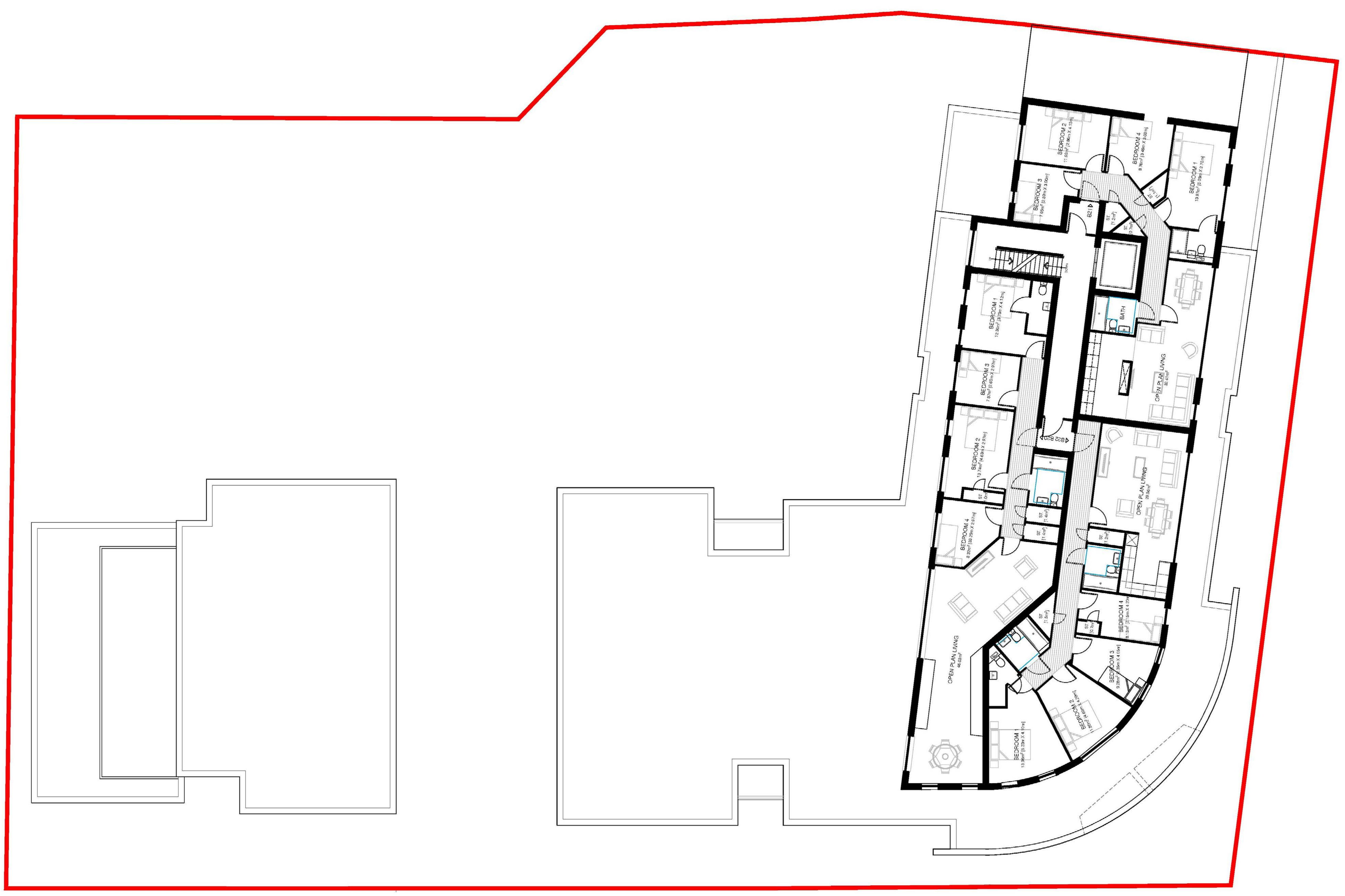
As Approved Third Floor